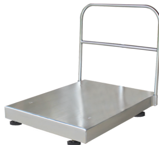
Stainless Steel Platform